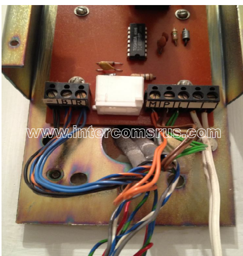
Later Example (plug in receiver)